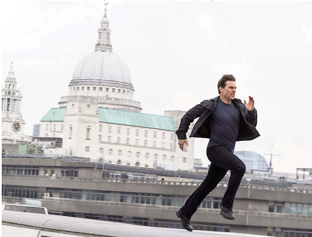
Tom Cruise stars in "Mission Impossible - Fallout."